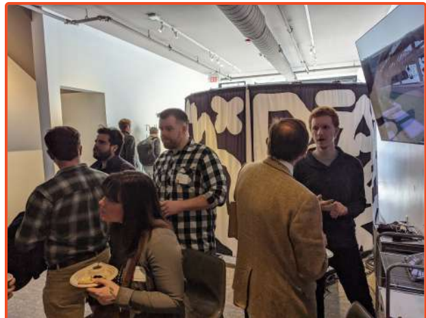
AR/VR Demonstrations at April's Creative Washtenaw Happy Hour hosted by CultureVerse