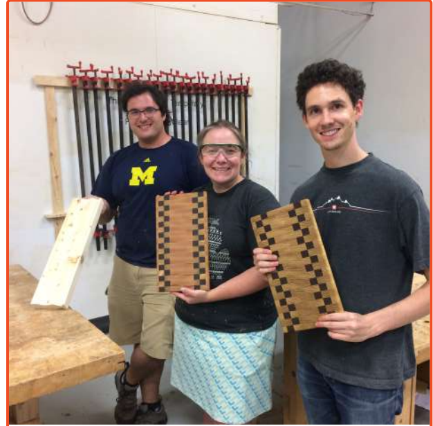
Maker Works "Woodshop," Ann Arbor, MI