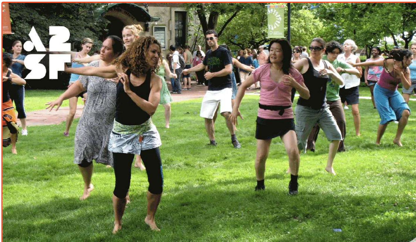
Ann Arbor Summer Festival Announces Full Season!

Enjoy programs and presentations from your arts + creative community.