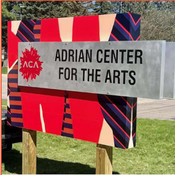
Adrian Center for the Arts - Sign, Adrian, MI

The Adrian Center for the Arts (ACA) is collaborative visual arts center located in a rural setting conducive to creativity. The ACA offers resident artists' space in clay, 2-dimensional, glass and metal sculpture and has a gallery hosting six shows a year. It offers classes for all ages in clay, painting, sculpture, fibers and print. The success of the ACA is based on a great many volunteers and an interested community.