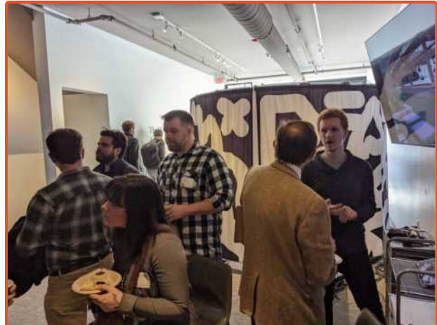
AR/VR Demonstrations at April's Creative Washtenaw Happy Hour hosted by CultureVerse