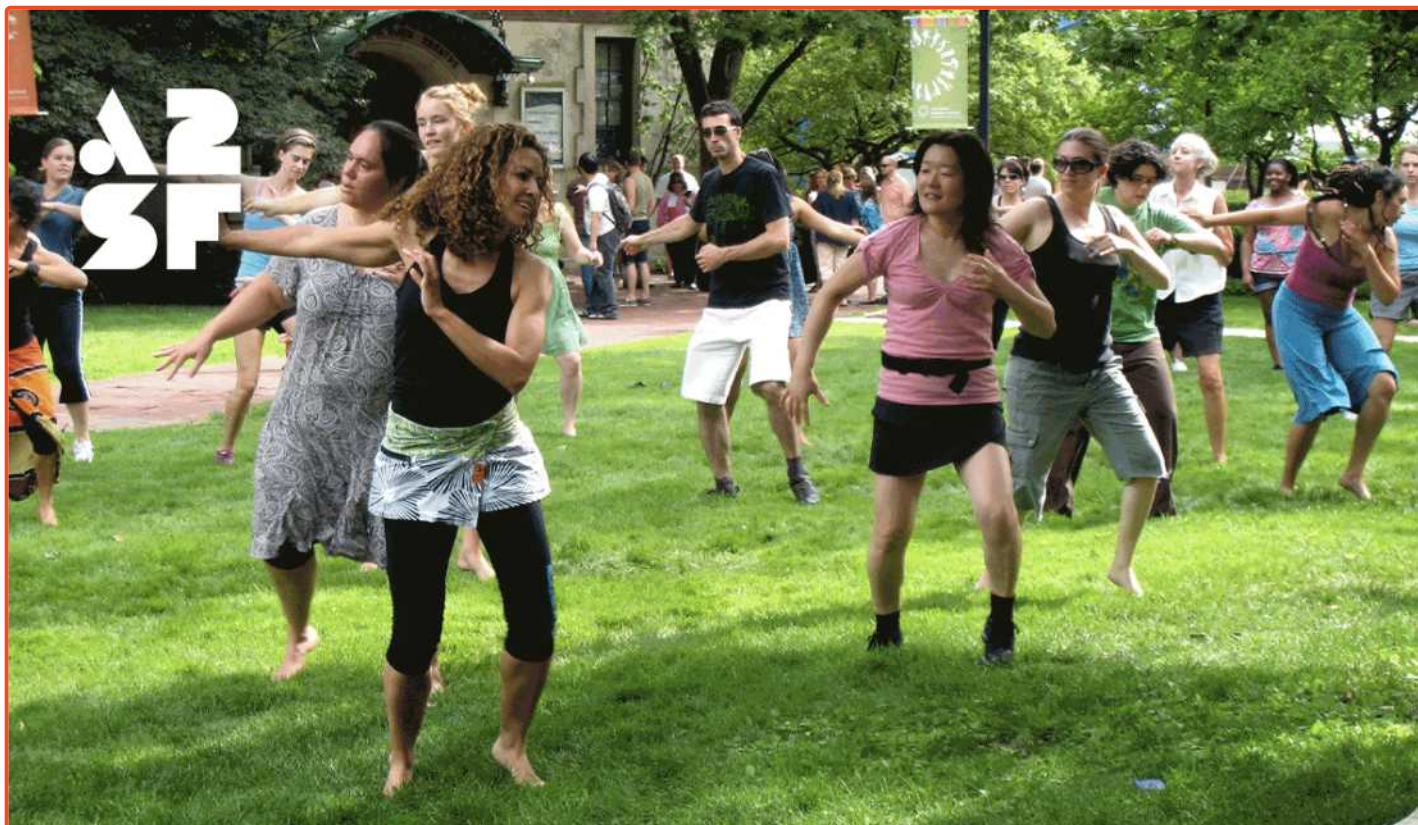
Ann Arbor Summer Festival Announces Full Season!

Enjoy programs and presentations from your arts + creative community.