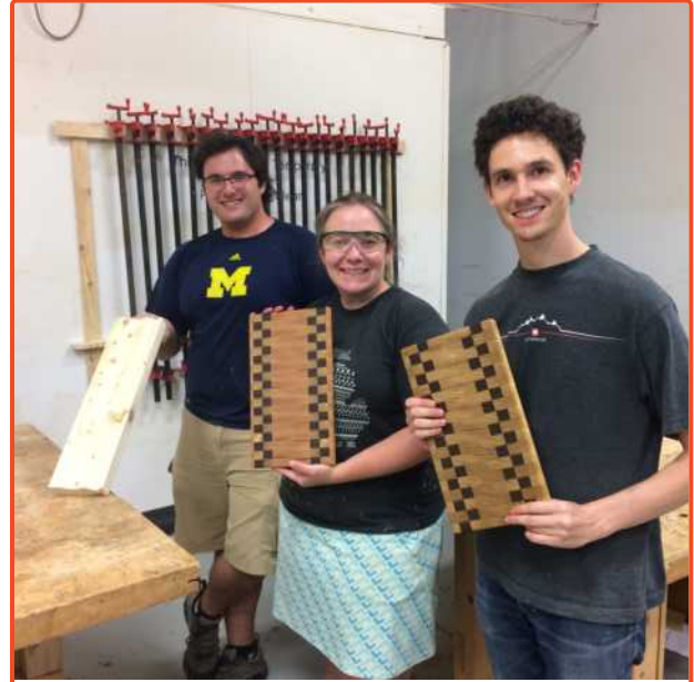
Maker Works "Woodshop," Ann Arbor, MI