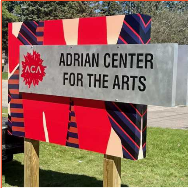
Adrian Center for the Arts - Sign, Adrian, MI

The Adrian Center for the Arts (ACA) is collaborative visual arts center located in a rural setting conducive to creativity. The ACA offers resident artists' space in clay, 2-dimensional, glass and metal sculpture and has a gallery hosting six shows a year. It offers classes for all ages in clay, painting, sculpture, fibers and print. The success of the ACA is based on a great many volunteers and an interested community.