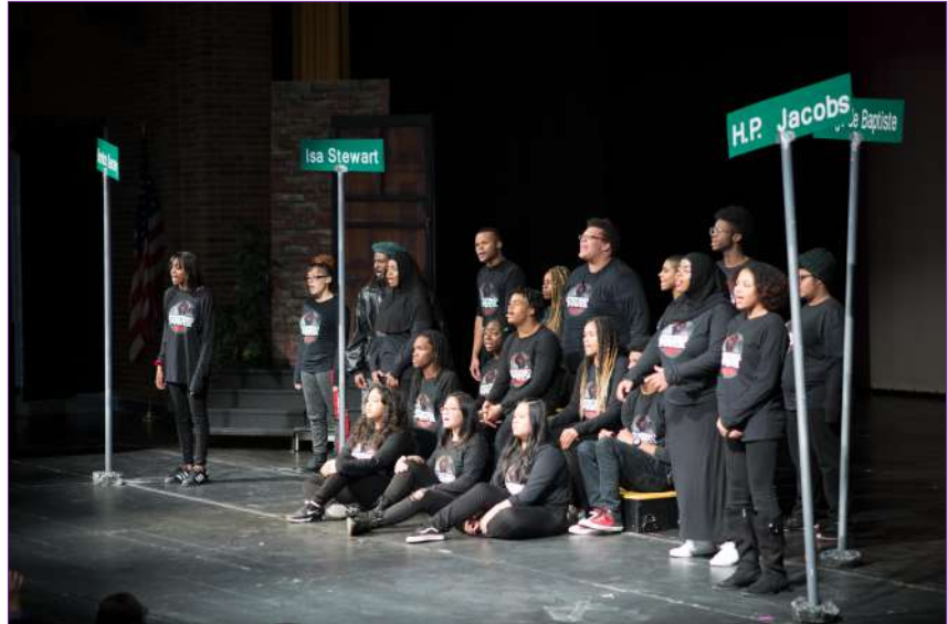
CW Aid directly supports projects like Aint Afraid.

Please visit our website here , to apply for CW Aid. Note: If you have already applied, and/or received funding, you may apply again!