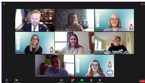
Pictured: Advocates in meeting with Rep. Peter Meijer _ MI3