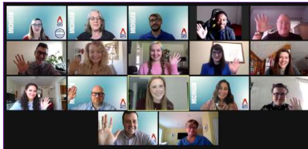
Pictured: Advocates in meeting with Rep Debbie Dingell MI-12