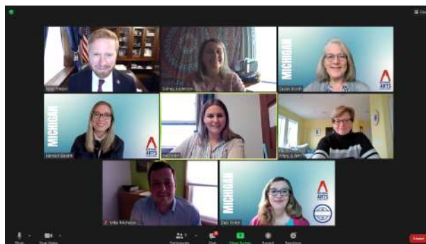
Zoom screenshot of a meeting with Rep. Peter Meijer, R, MI-3.

deb.polich@creativewashtenaw.org | 734-213-2733