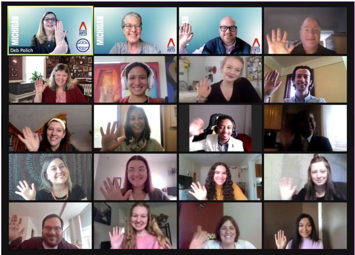
Michigan arts + creative industries advocates meet with Sen. Stabenow's Office