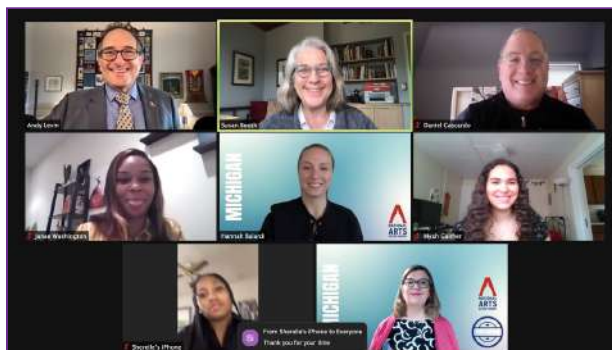
Pictured: Advocates in meeting with Rep. Levin, MI-9