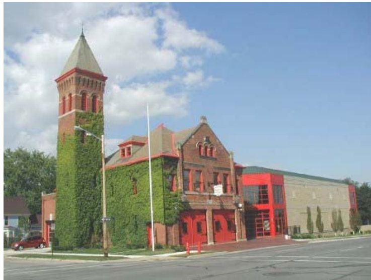
Ypsilanti, Freighthouse Museum

Why? Artists need affordable studio and rehearsal space. Artists want a facility that offers opportunities for easy interaction that can foster increased collaboration and idea-sharing. Artists have a strong interest in being able to share information, coordinate their activities, and discuss initiatives. Although the Riverside Arts Center offers performance and exhibition space, it currently lacks sufficient personnel to keep the building open extended hours as well as amenities needed for various types of rehearsals. There also is interest in providing artists with the resources to develop their marketing, sales, and management skills.