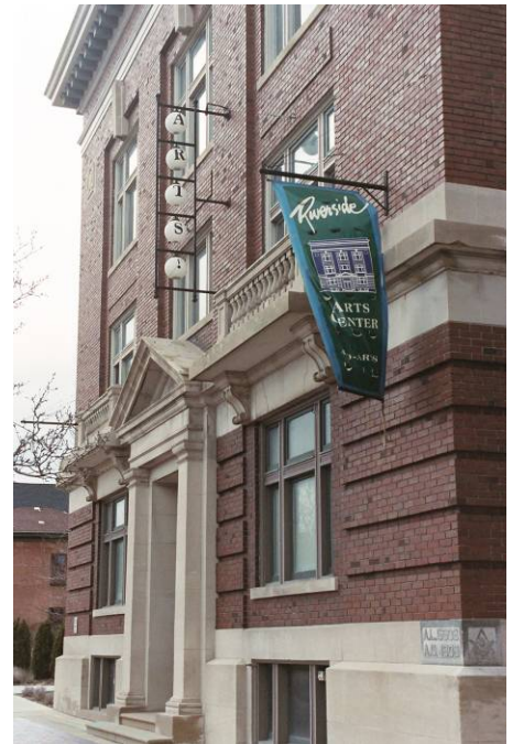
Riverside Arts Center

Vibrant arts community By 2013, cultural programs are central to the city’s revitalization. Riverside Art Center is a cultural center. The Shadow Art Fair continues to grow. Good communications helps audiences respond to programs.