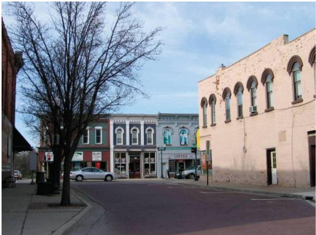
View of Main Street, Milan

Why? A number of buildings and spaces within buildings are currently vacant and could be used for arts and cultural purposes. Lively arts and cultural activities in currently vacant downtown buildings can attract new and increased foot traffic and potentially increase business for downtown merchants.