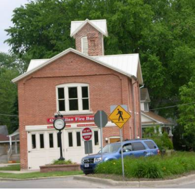
Milan Fire Barn

Community leaders understand that the future growth and success of the county is inextricably tied to the health and well-being of arts and culture that contribute to the area's quality of place. In a true collaborative effort, these leaders along with hundreds of grassroots individuals, have played and will continue to play a critical role in identifying the challenges outlined in the Washtenaw County Cultural Master Plan and Milan Area Working Plan and will continue to help develop the recommended actions.