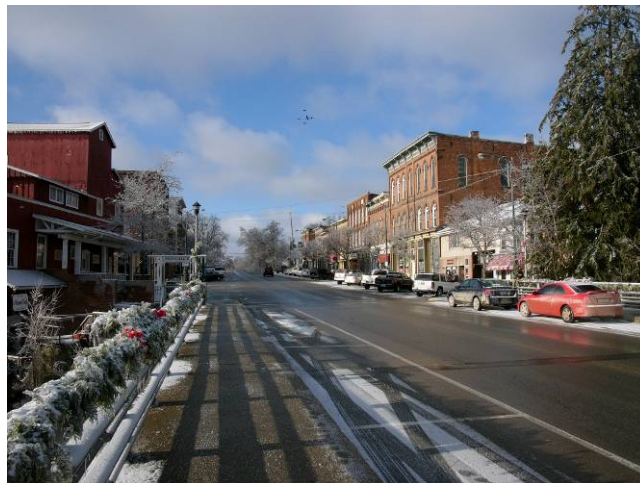
Downtown Manchester Area

Why? A handful of artists have expressed an interest in having a shared local arts space in Manchester. However, it is not known if substantial interest in such space exists, and if so, what type of facility and amenities would be needed. More research is necessary to determine next steps.