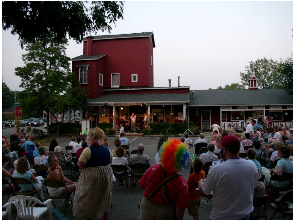
Music on the Manchester Mill porch (Hurricane Katrina Benefit Concert)