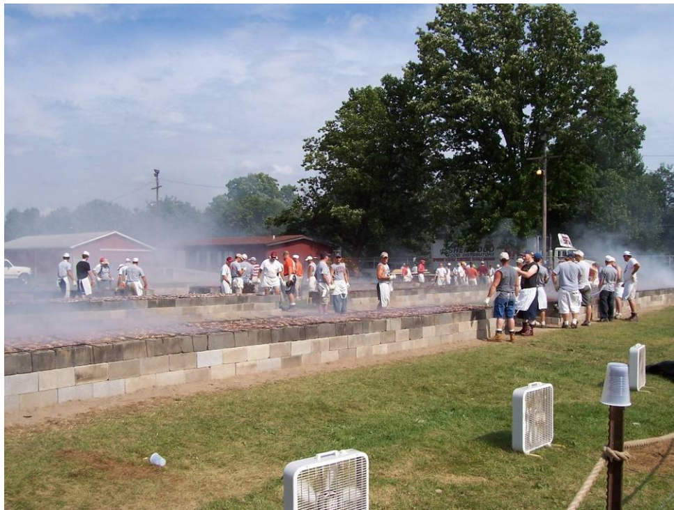
Manchester Chicken Broil

Why? The Chicken Broil is a unique and authentic event that is synonymous with Manchester in the minds of many. The cultural sector can build on this brand to capture attention for itself while at the same time drawing new audiences to the Chicken Broil and downtown Manchester.