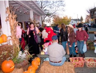
Halloween Apple Tradition

The group identified specific recommendations to address each of these strategic areas.