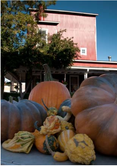
Manchester Farmers Market & Mill