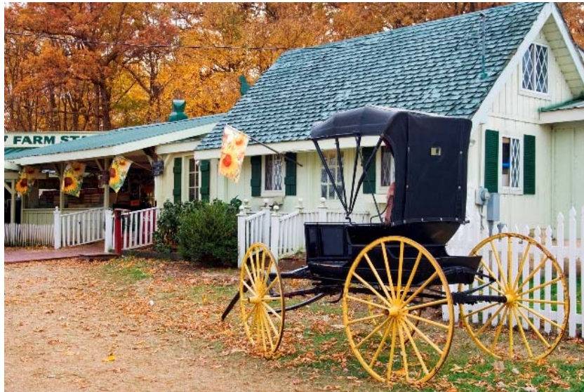
Jenny's Market House

Why? As gas prices rise, there is a need for youth and family-oriented cultural activities that do not require driving to another community. Dexter is home to many festivals and events, especially during the summer, but there is not always a place for youth and families.