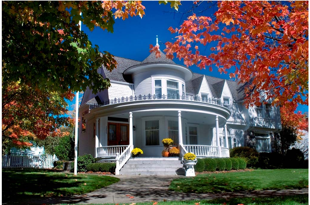
Honey House